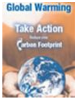
Global Warming – How to Reduce Your Carbon Footprint