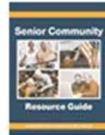
Senior Resource Guide