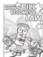
Children's Coloring Book – How a Bill Becomes Law