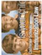
Child Immunization Law