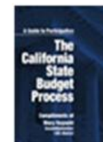
The California State Budget Process