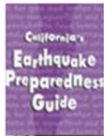
Earthquake Preparedness Guide