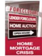
Home Mortgage Crisis Resource Guide