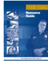
Public Safety Resource Guide