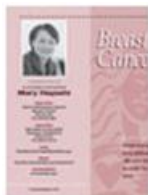
Breast Cancer Resource Guide