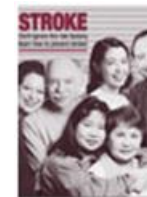
Stroke: Don't ignore the risk factors!